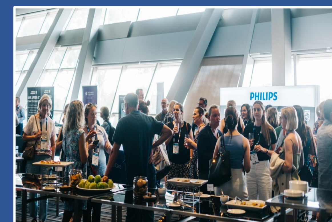
17 th ISMRT Australia and New Zealand National Chapters Joint Annual Meeting November 2024, Adelaide, Australia Breakout for Lunch Day 1 – Sponsor Display Hall