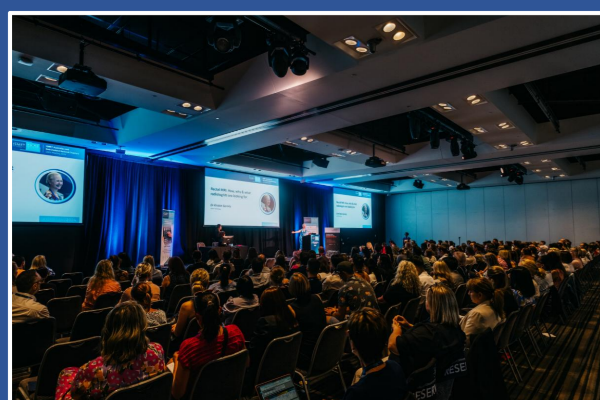
17 th ISMRT Australia and New Zealand National Chapters Joint Annual Meeting November 2024, Adelaide, Australia 250 delegates in attendance