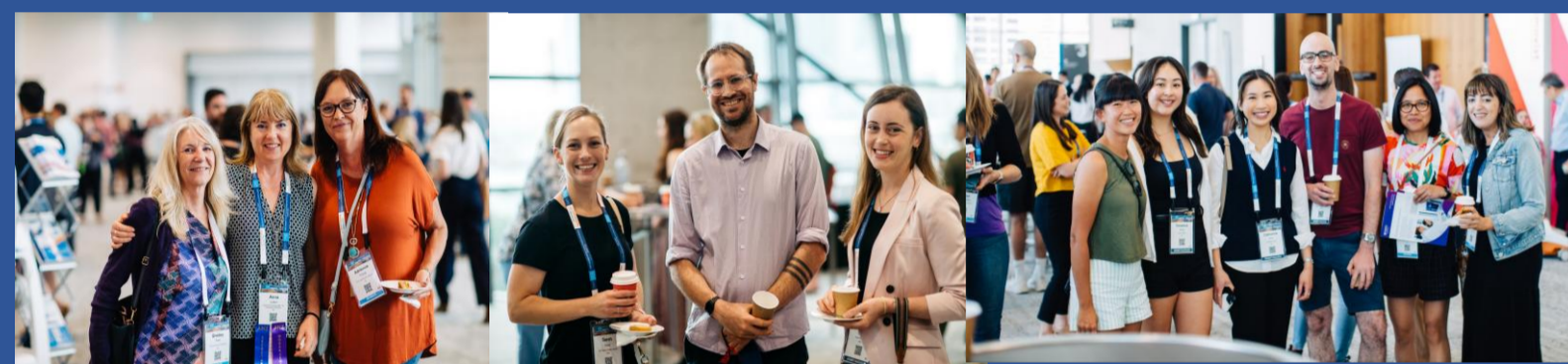
Some of our 450 Australian National Chapter Members