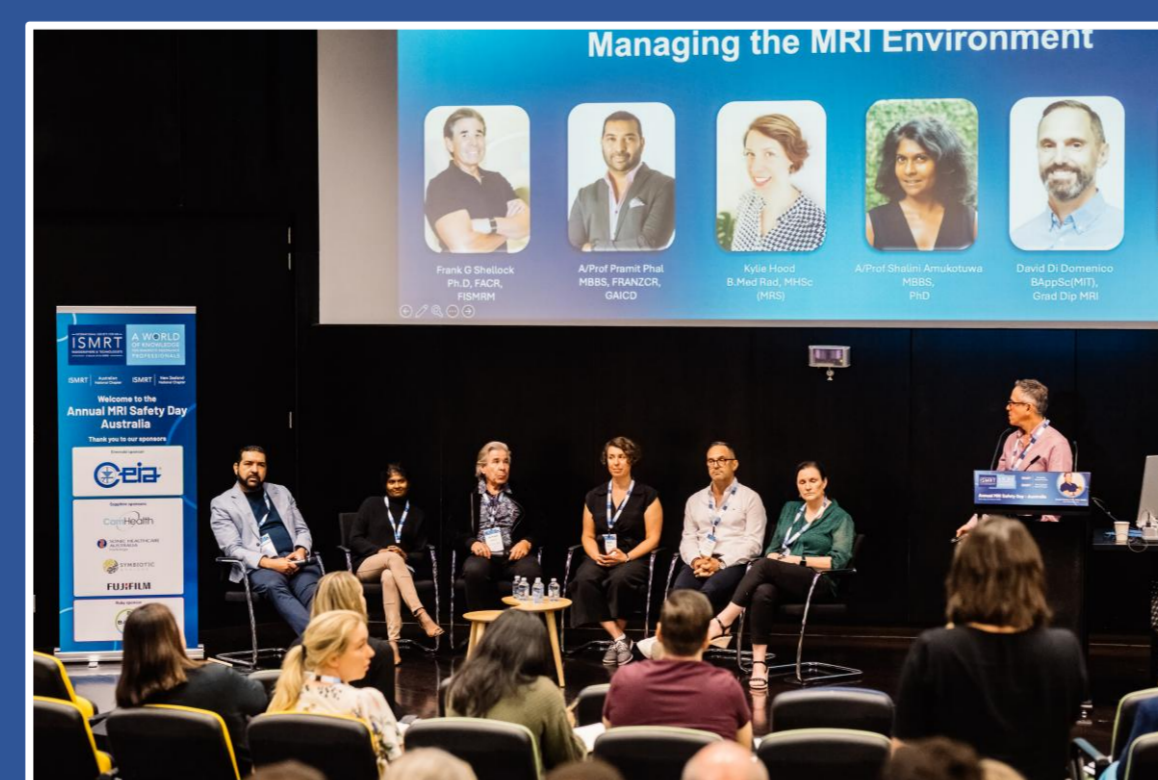
ISMRT Australia and New Zealand National Chapters 2025 Annual MRI Safety Day - Australia March 2025, Melbourne, Australia Expert Panel Discussion and Audience Q&A