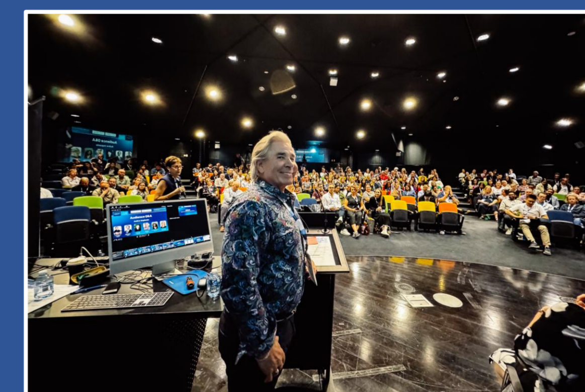
ISMRT Australia and New Zealand National Chapters 2025 Annual MRI Safety Day - Australia March 2025, Melbourne, Australia Dr Frank Shellock ; 240 delegates in attendance